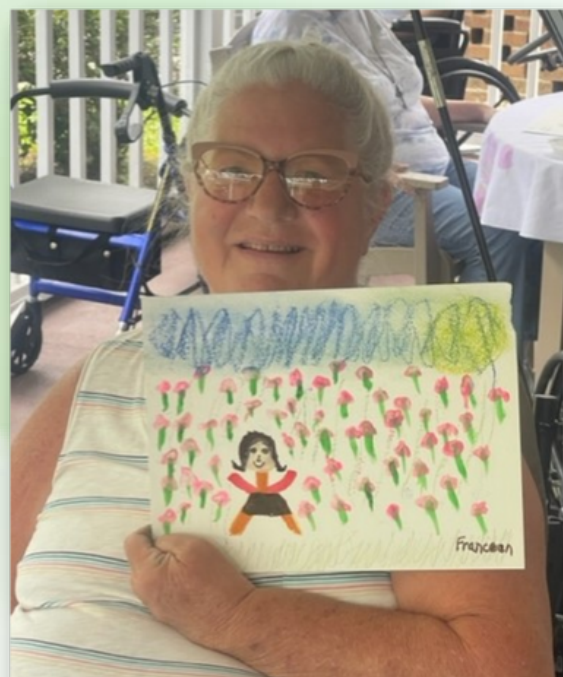
^ "SNOW PEAS"

"I love the smell of the ocean. It always brings back good memories!"