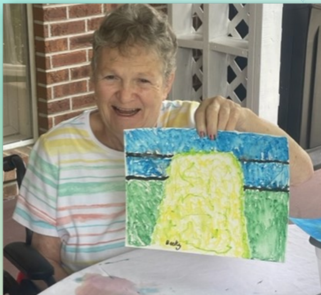
"SMELLING THE BUSH" ^