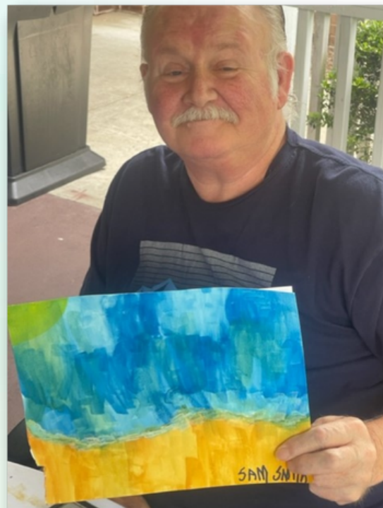
^ "THE OCEAN"

"When I was about four or five years old, I saw a pretty bush that I would shove my nose into. I remember it smelled so good!"